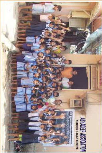
SUNDER NAGAR CENTRE