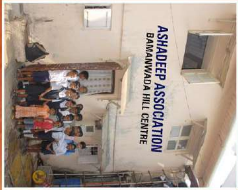
BAMANWADA HILL CENTRE